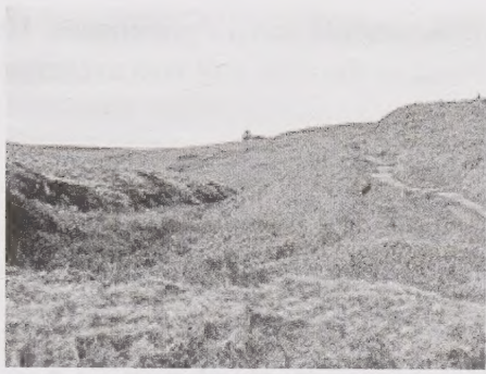
The climb to Top Withens, thought to have inspired the Earnshaws' home in Wuthering Heights